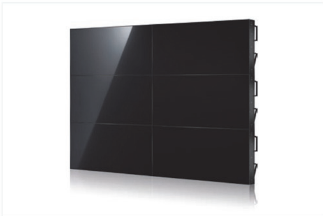
NEC 46" ULTRA NARROW LCD : WALL CONFIGURATION