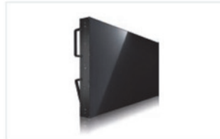
NEC 46" ULTRA NARROW LCD : FRAME DETAIL