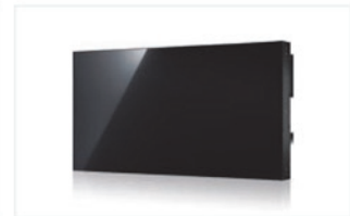
NEC 46" ULTRA NARROW LCD : ANGLE